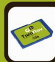
4Gb SD card