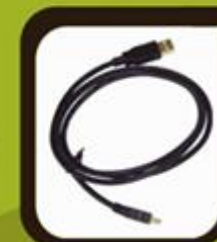
USB PC cable