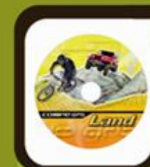
PC software (Basic mode)