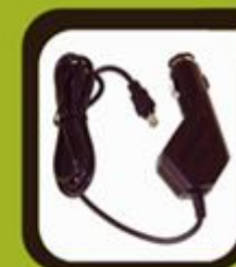
12V car plug